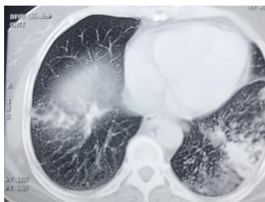
Fig. 3: Follow up ct thorax after one year showed resolution of Aspergilloma