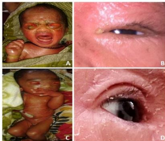
Fig. 4: (A, B) Pre and post treatment photographs of first case at 1 month showing significant correction of ectropion with regrowth of the eyelashes. (C, D) Pre and post treatment photographs of second case at 1 month showing significant improvement in ectropion with reappearance of the eyelashes