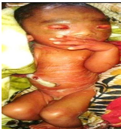
Fig. 2: Clinical photograph showing severe bilateral ectropion with loss of eyelashes and diffuse hyperemia. The skin appears shiny with a membrane like covering over it