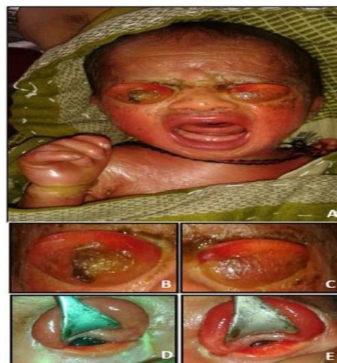
Fig. 1: (A, B, C) Clinical photograph showing severe ectropion with organized scab over tarsal conjunctiva of both upper eyelids with madarosis and eclabium. There is also presence of periorcular scabs with cutaneous hyperemia with scab over the right wrist area. (D, E) retraction of the lids showing clear cornea

A one-day-old neonate, informant being the mother presented with chief complaints of inability to close eyes due to eversion of both upper and lower lids since birth (Fig. 1). Neonate was born to a 26-year-old primigravida from a non-consanguineous marriage, at full term. Antenatal and intrapartum period was uneventful. There was no history of birth trauma, exposure to radiation and any significant drug intake by mother during the period of gestation. On examination, baby was covered by a shiny taut membrane all over the body. There was ectropion of both upper and lower eyelids with conjunctival congestion. There was also flattening of nasal bridge. Corneal was clear and pupil reacting to light.