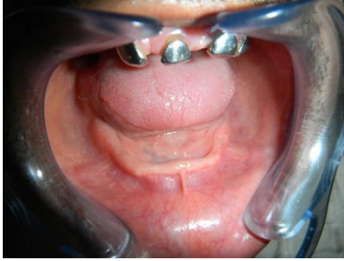
Fig. 2: Partial anodontia of maxillary teeth and complete anodontia of mandibular teeth

Radiographic examination revealed presence of maxillary canines, central incisors and maxillary left first molar, absence of rest of the teeth in the maxillary arch and absence of all the teeth in the mandibular arch, and decreased alveolar ridge height in the edentulous areas. (Fig. 3)