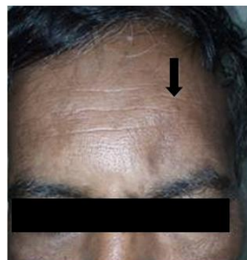
Fig. 1: Patient forehead on the left side showing depression

On intraoral examination, it was seen that the maxillary arch and mandibular arch was partially edentulous. No presence of bony irregularities or tenderness. There were no occlusal derangements. Based on patient history and clinical examination, a provisional diagnosis of supraorbital rim fracture was given. The conventional posterior anterior radiological view did not appreciate any abnormalities. The computed tomography examination revealed, fracture of the left frontal sinus. A three dimensional view revealed a depressed frontal bone fracture. There was left side supraorbital rim fracture in the left side. A final diagnosis of left supraorbital rim and frontal sinus fracture was given and patient was referred for surgical evaluation.