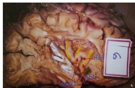
Fig. 5: Discontinuous Short insular sulcus & joined Anterior and Middle short gyrus (specimen No. 6 right).