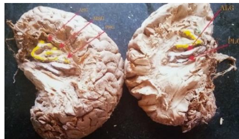
Fig. 2: Left side insular cortex: anterior short gyrus, middle short gyrus, Posterior short gyrus, All 3 Short gyri BIFID. Right side insular cortex: anterior long gyrus BIFID, Posterior long gyrus hypoplastic

Posterior peripheral sulcus (PPS) = from Posterosuperior insular point to Posteroinferior insular point.