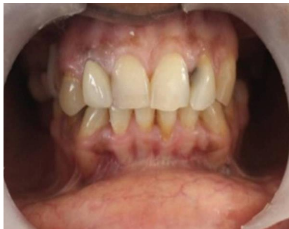
Figure 17: Final prosthesis cemented.