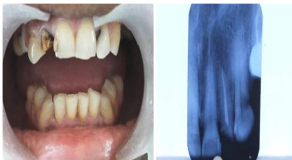
Figure 14: Intra Oral view with preoperative Radiograph.