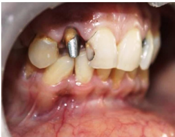
Figure 16: Custom cast post cementation.