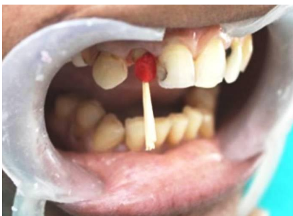
Figure 15: Fabrication of resin pattern.