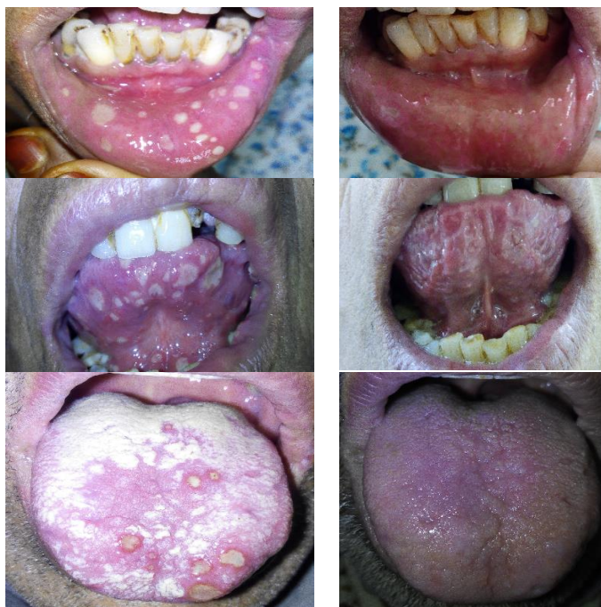
Fig. 1: Clinical photographs of the patients before and after treatment using tetracycline and prednisolone elixir

prepared by dissolving tetracycline powder contained within 500mg capsule of tetracycline in 50 ml of water. Whereas Group B was asked to dissolve 5mg prednisolone tablet in 50ml of water. All the patients in both groups were instructed to swish and spit the rinse 3 times in a day for 15 days. All patients were advised not to take food for 30 minutes after using the respective elixir. Two weeks is considered the mean healing time of recurrent aphthous ulcers 21 therefore the patients were examined 4 times in 15 days on the fifth, eighth, tenth and fifteenth day. Patients were recalled after 1 month and 2 month time interval to check number of episodes of recurrence. In every visit all study parameters were again assessed. In addition any change in pain severity, formation of new ulcers and possible side effects of the drug were evaluated.