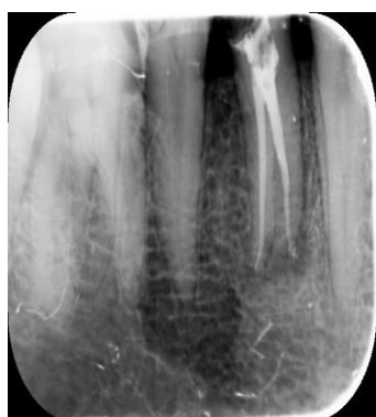
Fig. 3: Radiograph after obturation