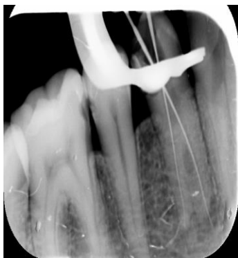
Fig. 2: Working length determination radiograph