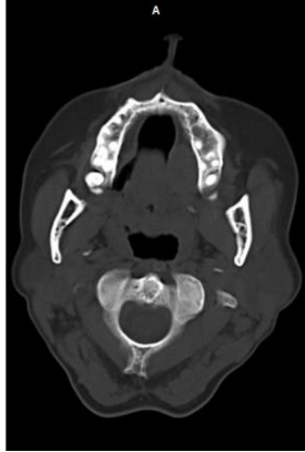
Fig. 2: Computed tomography-PNS showing the lesion over left postero lateral surface of hard palate

For confirmatory diagnosis, incisional biopsy was done which revealed the lesion to be a pleomorphic adenoma of hard palate. Under all routine preoperative investigations, surgical excision of the lesion was planned under general anaesthesia, the lesion is surgically excised with ligation of greater palatine neurovascular bundle, along with the excision of overlying normal mucosa to prevent recurrence in other minor salivary glands of that particular site (Fig. 3), followed by placement of zinc oxide Eugenol pack with an acrylic plate secured with wires to the tooth which was removed after a week and the wound was allowed to heal secondarily (Fig. 4, 5). Histopathology of the specimen confirmed the lesion to be a pleomorphic adenoma. Histopathological section showed myoepithelial cells with hyperchromatic nuclei arranged in acinar, ductal and trabeculae pattern. Connective tissue showing mucoid and myxoid material and extravagated Rbcs. (Fig. 6). Postoperative healing and possibility of recurrence could not be ruled out as the patient had not turned up for follow up visit after acrylic plate removal on 7 th postoperative day.