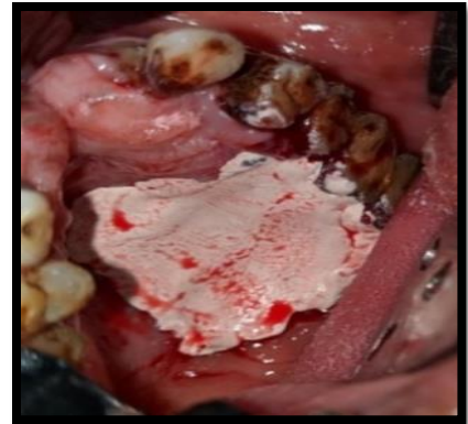
Fig. 4: Placement of zinc oxide eugenol pack