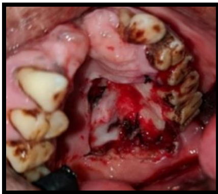
Fig. 3: Surgical excision of the lesion preserving greater palatine neurovascular bundle

For confirmatory diagnosis, incisional biopsy was done which revealed the lesion to be a pleomorphic adenoma of hard palate. Under all routine preoperative investigations, surgical excision of the lesion was planned under general anaesthesia, the lesion is surgically excised with ligation of greater palatine neurovascular bundle, along with the excision of overlying normal mucosa to prevent recurrence in other minor salivary glands of that particular site (Fig. 3), followed by placement of zinc oxide Eugenol pack with an acrylic plate secured with wires to the tooth which was removed after a week and the wound was allowed to heal secondarily (Fig. 4, 5). Histopathology of the specimen confirmed the lesion to be a pleomorphic adenoma. Histopathological section showed myoepithelial cells with hyperchromatic nuclei arranged in acinar, ductal and trabeculae pattern. Connective tissue showing mucoid and myxoid material and extravagated Rbcs. (Fig. 6). Postoperative healing and possibility of recurrence could not be ruled out as the patient had not turned up for follow up visit after acrylic plate removal on 7 th postoperative day.