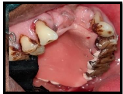
Fig. 5: Acrylic plate placed over the pack