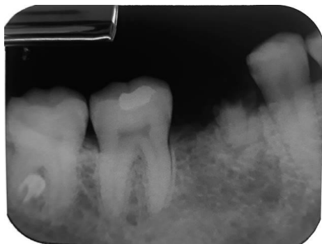
Fig. 1: The IOPAR shows two root pieces with ill-defined periapical radiolucency suggestive of periapical abscess in right mandibular second molar. A well-defined radiopaque structure superimposing on the roots of third molar, which was circular with small three spikes like projections from its base resembling like a miniature UFO was also noticed