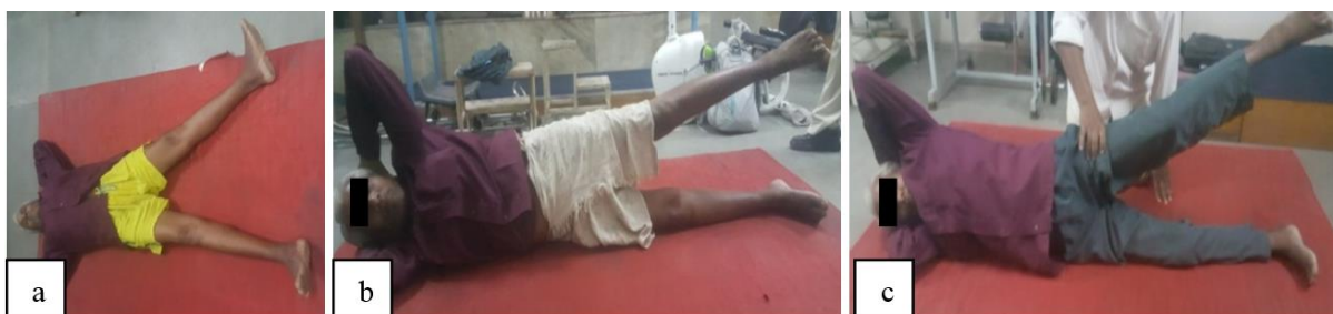
Fig 3: (a): Immediate post op. grade 2' (b): At 6 weeks grade 3; (c): At 6 months Grade