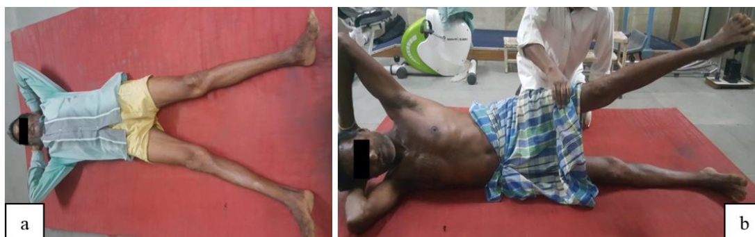
Fig. 2: Abductor muscle power (a): Immediate Post-op grade 2; (b): At 6 months grade 5