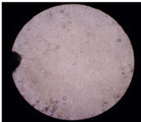
Fig. 1: TTO treated with MDA MB cancer cell line after 48h showing cytotoxic effect with 50% cell lysis.