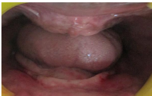
Fig. 1: Intra oral view of maxillary and mandibular arch

OPG and diagnostic impressions were made. Bone availability and quality of lower arch was evaluated by doing bone mapping intraorally and on the cast. (Fig. 1) Blood investigations were done to analyse the general health of the patient. Patient was informed about the possibility of an attachment retained implant supported overdenture as the best treatment option to solve his complaints. Two implants were planned in the canine region and locator attachment was used for retention of overdenture as the interridge distance was less.