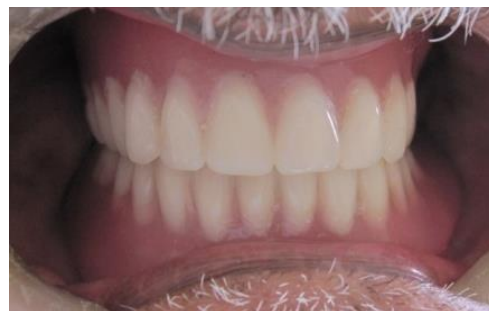
Fig. 9: Denture insertion