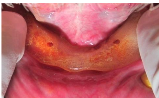
Fig. 2: Surgical stent made using clear acrylic resin

Surgical stent was made using clear acrylic and two holes were made in the stent corresponding to the canine region. (Fig. 2) Two Nobel biocare replace select implants of size 4.3x 13mm were placed in the canine region and cover screw was put and tightened. (Fig. 3). Patient was recalled after a week for suture removal and a review.