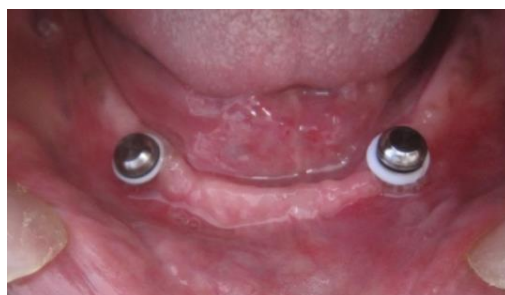
Fig. 6: Block out spacer and metal cap

Self cure acrylic was filled into that space in the denture and denture was placed on the mandibular arch, the metal cap and black processing cap was picked in the denture after the self cure sets. Black processing cap can then be removed and retentive attachment cap can be fitted and placed inside the metal cap based on the amount of retention required. (Fig 7 & 8) Finally the maxillary and mandibular denture is inserted inside the patients mouth and checked for occlusion and patient comfort. Patient was very satisfied with the denture because of increased retention, stability, masticatory efficiency and comfort. (Fig. 9)