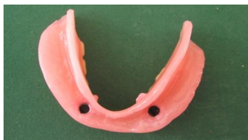
Fig. 7: Black processing cap picked in denture

Self cure acrylic was filled into that space in the denture and denture was placed on the mandibular arch, the metal cap and black processing cap was picked in the denture after the self cure sets. Black processing cap can then be removed and retentive attachment cap can be fitted and placed inside the metal cap based on the amount of retention required. (Fig 7 & 8) Finally the maxillary and mandibular denture is inserted inside the patients mouth and checked for occlusion and patient comfort. Patient was very satisfied with the denture because of increased retention, stability, masticatory efficiency and comfort. (Fig. 9)