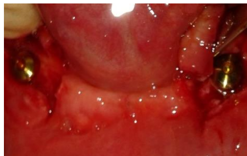
Fig. 3: Implant placement