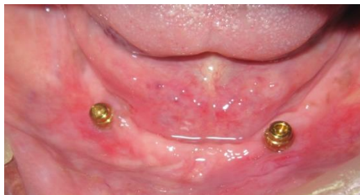
Fig. 5: Locator attachment placed