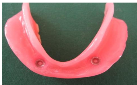
Fig. 8: Pink coloured retentive cap