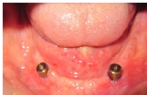
Fig. 4: Healing abutments were placed

Patient reported after 4 months of healing period for the prosthetic rehabilitation. A new conventional complete denture was fabricated in maxillary and mandibular arch. During jaw relation it was found that ball attachment cannot be used for retaining the overdenture because of less interridge distance, so locator attachment was selected for retention. Second stage surgery was performed and healing abutments were placed for getting proper gingival cuff. (Fig. 4)