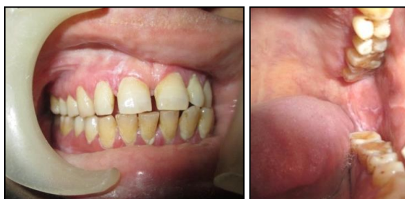
Fig. 8: Post treatment photographs