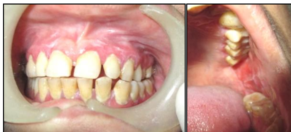
Fig. 7: Pre treatment photographs