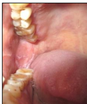
Fig. 3: Right buccal mucosa reticular LP