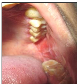
Fig. 2: Left buccal mucosa erosive LP