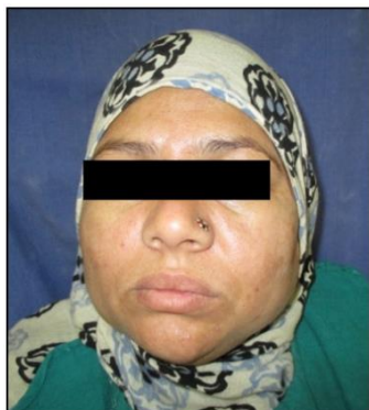
Fig. 1: 38 year old female patient

Following investigations were advised-orthopantomogram (OPG), complete hemogram, blood sugar, cytosmear, and incisional biopsy from left buccal mucosa. All laboratory findings were within normal limits, and biopsy confirmed as Lichen planus. Psychiatric consultaion and counselling was done for the patient.