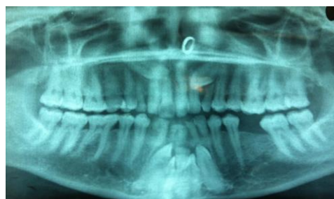
Fig. 2: Radiograph showing multiple impacted teeth

Medical, family history and extra oral examination were not suggestive of any syndrome or metabolic disorder. After consultation with the orthodontist a joint decision was made to extract the impacted teeth followed by prosthesis.