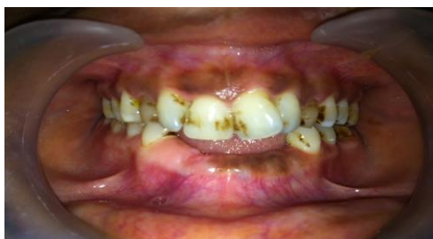
Fig. 1: Clinical intraoral photograph

A 22-year-old female patient presented with a chief complaint of multiple missing teeth in lower anterior region and compromised esthetics. Intraoral examination revealed that her lower incisors and canines and lower left first molar were missing along with bilateral retained upper deciduous canine and missing upper permanent canines. The patient was of mesomorphic built with a current history of extraction of her over retained lower deciduous anterior teeth.