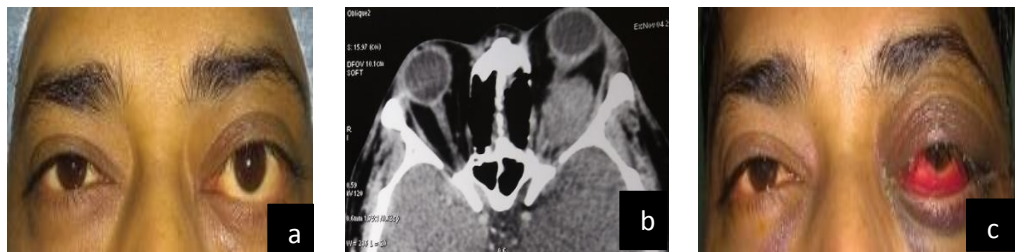
Fig. 1: a: Clinical photograph showing proptosis; b: CT scan, axial view showing an intraconal mass extending upto apex; c: Postoperative clinical photograph showing proptosis and ecchymosis

examination of the right eye was normal. Left eye showed an axial proptosis with increased resistance to retropulsion [Fig. 1a]. Pupillary reaction was brisk. Orbital rim was intact, extraocular movements were normal, no regional lymph nodes palpable. His color vision and full threshold visual fields were normal. CT scan suggested a large, well defined intraconal mass in the left orbit between the lateral rectus and the optic nerve extending from the mid orbit extending till the orbital apex [Fig. 1b]. A provisional diagnosis of cavernous hemangioma or schwannoma was made. Left lateral orbitotomy under guarded prognosis was planned after a detailed discussion of the possible complications with the patient.