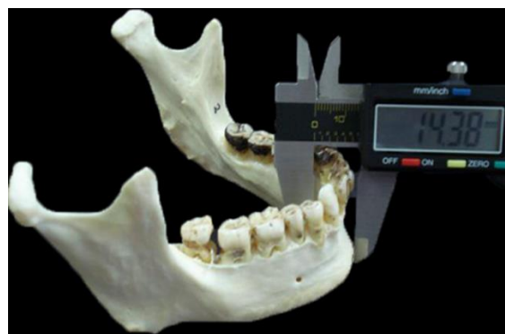
Fig. 1: MBT-SM (Mandibular body thickness at Symphysis menti)