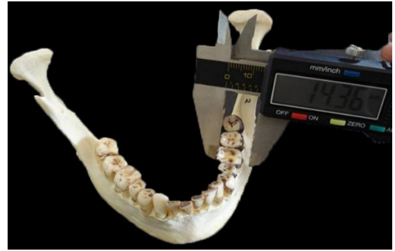
Fig. 3: MBT-M: Mandibular body thickness at molar teeth