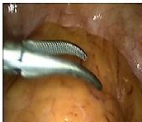
Fig. 3: Image showing the peritoneal and retrovaginal septum involvement of endometriotic lesions during the laparoscopic procedure; Endoscopic department, Robert Károly Private Hospital, Budapest, Hungary, 2016