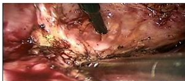
Fig. 6: Image showing the closure of the trimmed uterine wall, with a 2.0 absorbable suture, during the laparoscopic procedure; Endoscopic department, Robert Károly Private Hospital, Budapest, Hungary, 2016