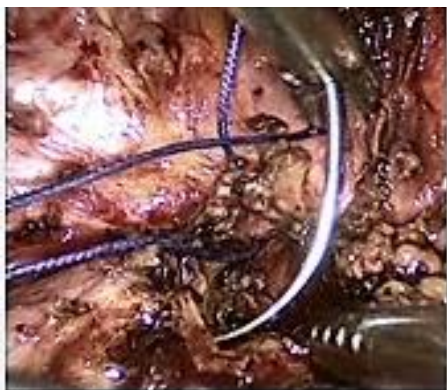
Fig. 2: Image showing adhesions of the bladder wall, isthmocele and part of major omentum during the laparoscopic procedure; Endoscopic department, Robert Károly Private Hospital, Budapest, Hungary, 2016