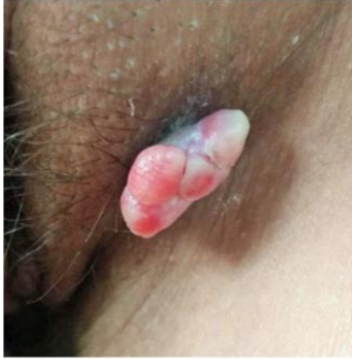
Fig. 3: Pyogenic granuloma on the left labia majora in a years old woman