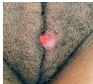
Fig. 1: Pyogenic Granuloma on lower aspect of left labia majora in a 23 years old female

dermatophyte infection. There was no history of any trauma prior to the appearance of lesion. VDRL and HIV serology were negative. Excisional biopsy was done which revealed that the epidermis was ulcerated and dermis showed small capillary sized blood vessels with congestion and haemorrhage. She was also given treatment for dermatophyte infection.