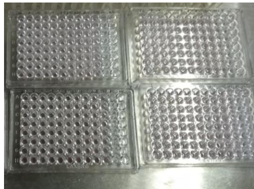
Fig. 3: Stability Testing by Antifungal Susceptibility Testing -Broth Microdilution Method