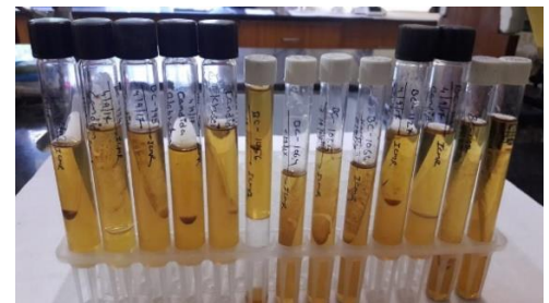
Fig. 2: Oil Overlay Technique for Preservation