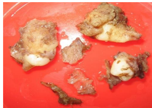
Fig. 2: Gross specimen