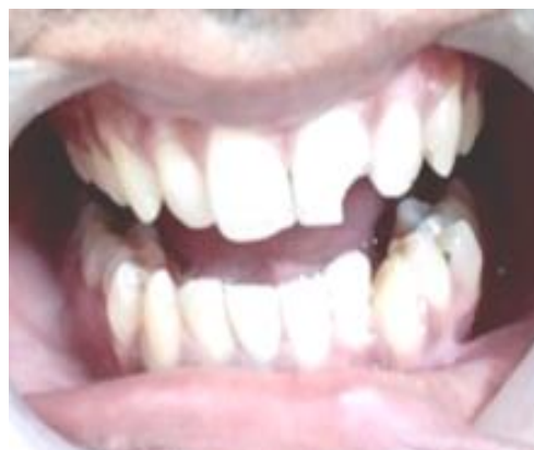
Fig. 1: Pre-operative intraoral photograph of case 1

After removal of excess cement from the buccal and palatal surfaces using an explorer and with the help of a mylar strip or a floss for the interproximal areas, a layer of glycerine was applied on the margins. The restorations were then photopolymerized and the occlusion was checked if any points came on the porcelain-tooth interface. Thereafter, the margins were finished and polished with diamond burs, rubber points and diamond polishing paste (Fig. 5). 7