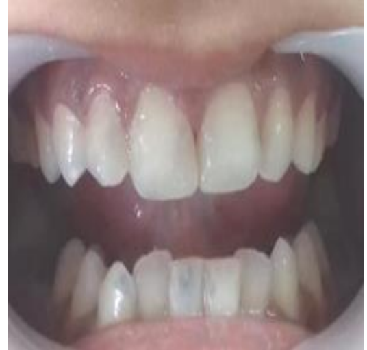
Fig. 7: Post-operative photograph for the case 2