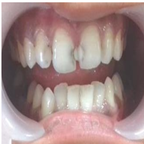
Fig. 6: Pre-operative photograph for the case 2

A 27 year old female patient reported to the department of Conservative Dentistry and Endodontics with the chief complaint of discoloured and dislodged restoration with respect to the upper front teeth. On clinical examination, the upper front teeth showed brown discrete discoloration due to previous restoration (Fig. 6). This case was similar to first case and composite restoration and ceramic veneers were planned. Veneer preparation and cementation was done as discussed earlier (Fig. 7).