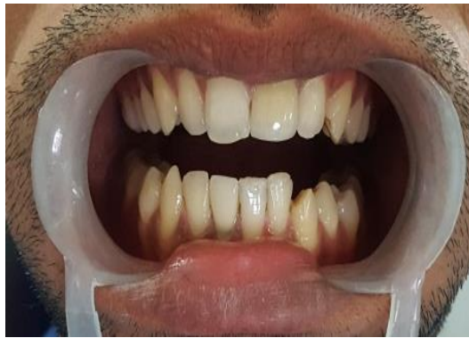
Fig. 5: Post-operative intraoral photograph showing veneer after cementation