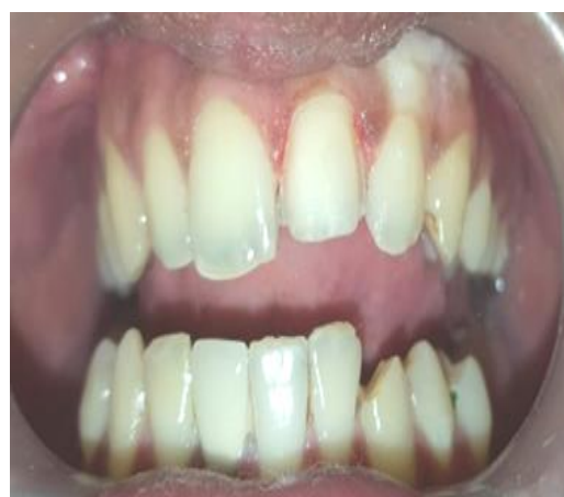
Fig. 2: Intraoral photograph showing Veneer preparation