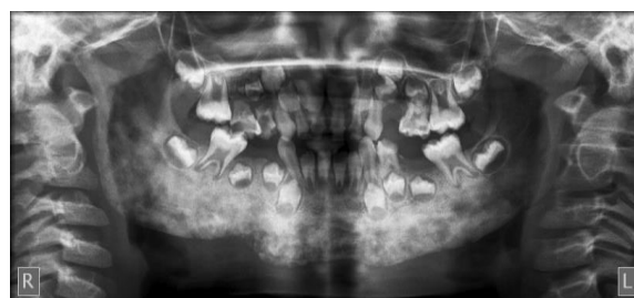
Fig. 5: Panoramic radiograph showing enlarged mandible with altered trabecular pattern having areas of radiopacity and radiolucency giving a cotton wool appearance