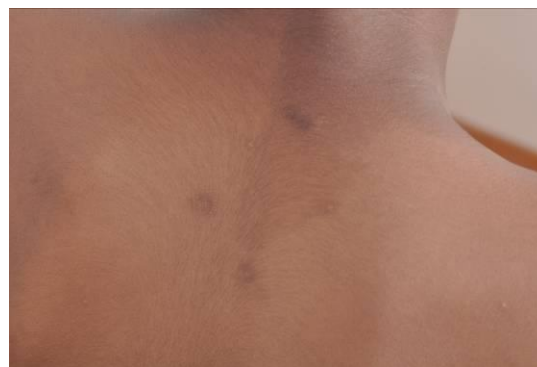
Fig. 2: Photograph showing café-au-lait macule on right side of the neck