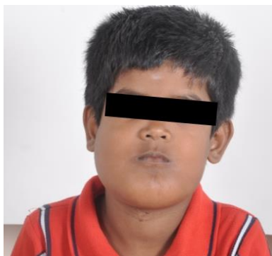
Fig. 1: The extra oral photograph showing gross facial asymmetry due to diffused swelling involving the lower half of the face

Ultrasonography of abdomen revealed mild hydronephrosis on right side and auditory brain stem report showed minimal hearing loss on the left side and hearing sensitivity was within the normal limit in the right ear. No abnormalities were reported in the hematology and Echocardiography examination. Serum alkaline phosphatase was 215U/L and serum calcium level was 9.2mg/dl. Based on the investigation final diagnosis of the Jaffe-Lichtenstein syndrome (JLS) was made and patient was referred to craniofacial unit for the further management.