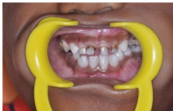
Fig. 4: The photograph showing diffused enlargement of the lower alveolar process