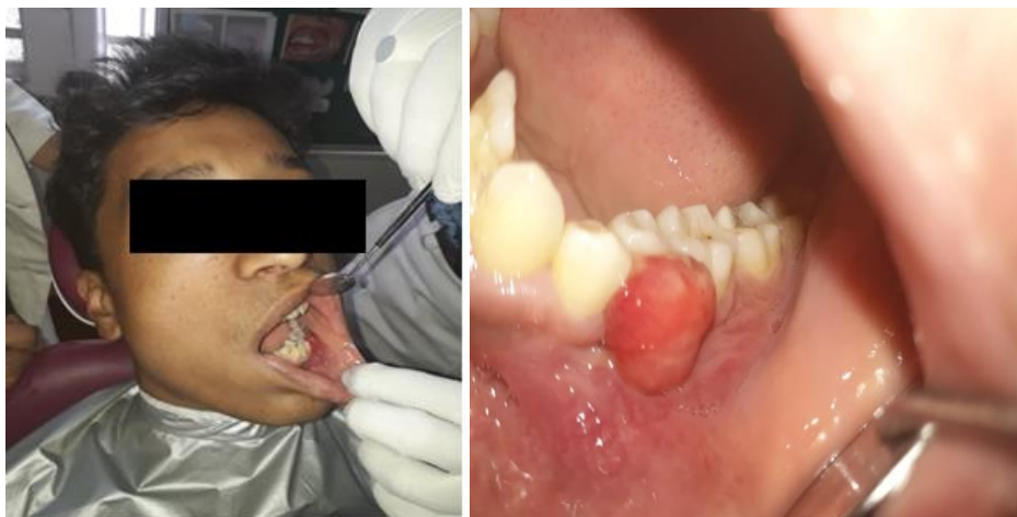
Fig. 1 and 2: Showing solitary, erythematous growth present in left mandibular premolar region