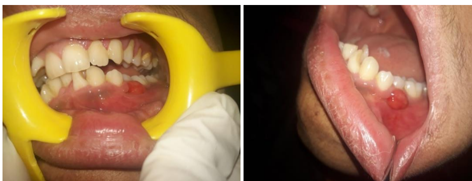
Fig. 3 and 4: Showing recurrence of lesion after 2 month of excision.