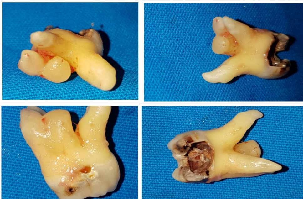
Fig. 1: Four rooted maxillary third molar

of Dental Sciences and Research Centre, Pune. Although these teeth were having abnormal and difficult root patterns, we had extracted these teeth in-toto with no postoperative complications. Fig. 1 shows extracted maxillary third molar tooth which is having four roots whereas Fig. 2 indicates extracted mandibular third molar tooth which is having three roots.