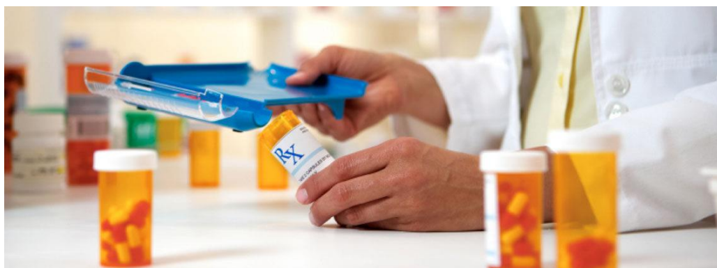
Fig. 1: Graphical abstract

Keywords: Pharmacy Practice; Drugs; Dosage Forms; Compounding; Equipment; Pharmacopeia.