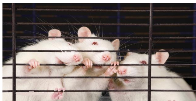
Fig. 1: Selected mice