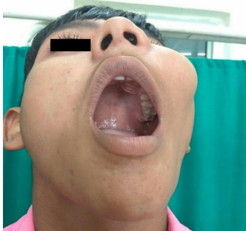
Fig. 1b: Swelling in left cheek