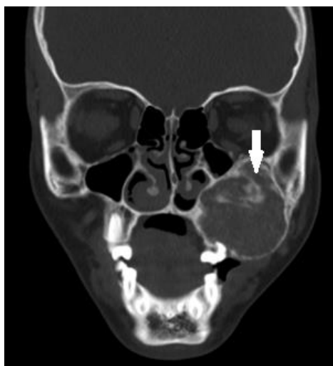
Fig. 2a: CT PNS- Coronal section showing Ring and arc calcification indicated by arrow.