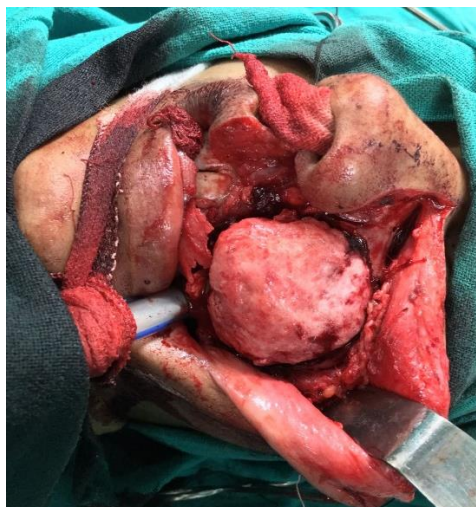
Fig. 3a: Surgical excision of mass using Weber-Ferguson approach