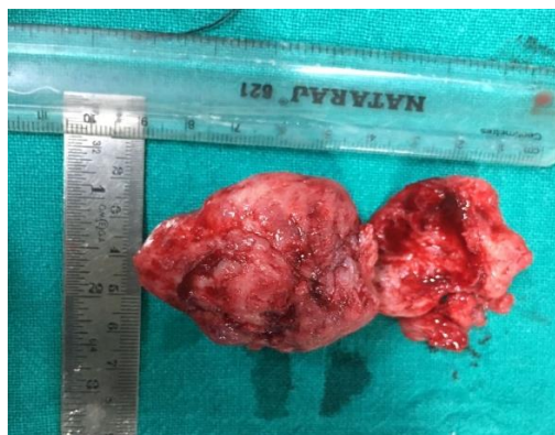
Fig. 3b: Excised mass of 9×5×4cm