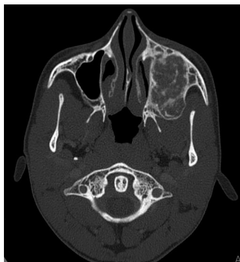
Fig. 2d: CT PNS- Axial section showing calcification in the lesion