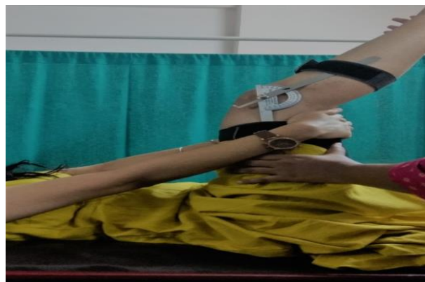
Fig. 2: End position of active knee extension test (AKET)

KED angle was measured by universal goniometer (Fig. 3). The subjects having bilateral hamstring tightness of 20 degrees or more were included in the study. Any history of low back pain within last 3 weeks, history of lower limb injury within last 6 weeks, hypermobility at knee joint/joints, history of hamstring tear, history of any orthopedic surgery of lower limb within last 6 weeks and subjects with any neurological disorder were excluded from the study. The study was conducted in duration of 4 months.