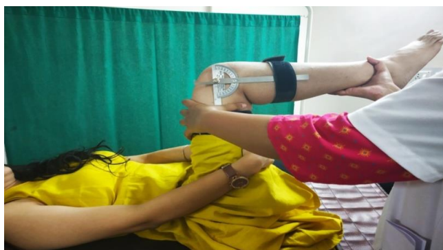
Fig. 1: Initial position of active knee extension test (AKET)

A comparative experimental study was conducted on 200 normal healthy individuals (100 males and 100 females) between the age group of 18 to 25 years. Institutional ethics committee approval was obtained to carry out research work. A simple random sampling method was used to select the subjects in the study. The purpose of study was explained and written consent was obtained from subjects. The subjects were evaluated for bilateral hamstring muscle tightness and were determined by knee extension deficit (KED) by active knee extension test (AKET) (Fig. 1, 2).