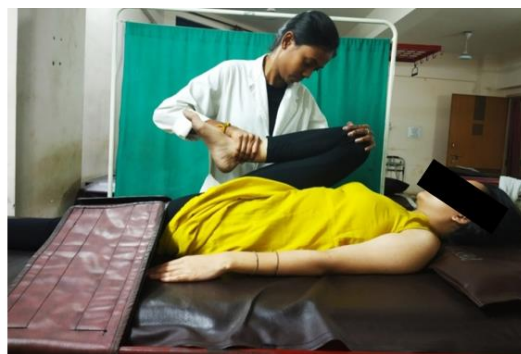
Fig. 4: Knee to chest position

The subject was lying in supine position on treatment table. On each subject, on left leg, 90-90 passive hamstring stretching (17) was performed for 60 seconds and on right leg, knee to chest position (Fig. 4) for 30 seconds plus 90-90 passive stretching for 30 seconds was performed (2), duration of stretch was measured by using stopwatch (Fig. 5). Stabilizing belt was used to keep opposite thigh in neutral position (Fig. 6). No rest was allowed between each session on right leg. After one minute rest, post stretching hamstring flexibility was measured by AKET in degrees with the help of universal goniometer (Fig. 1, 2) (20, 21). The data was collected and analyzed.