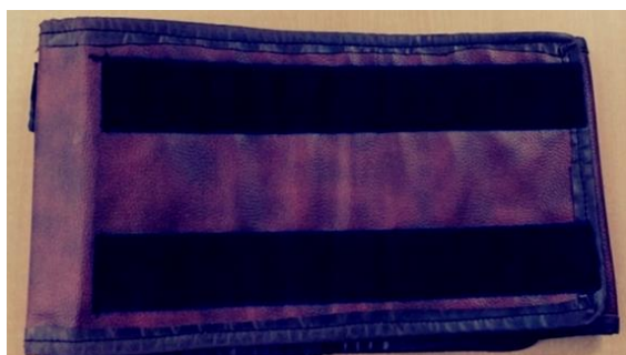
Fig. 6: Stabilizing belt