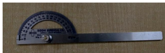
Fig. 3: Universal goniometer

KED angle was measured by universal goniometer (Fig. 3). The subjects having bilateral hamstring tightness of 20 degrees or more were included in the study. Any history of low back pain within last 3 weeks, history of lower limb injury within last 6 weeks, hypermobility at knee joint/joints, history of hamstring tear, history of any orthopedic surgery of lower limb within last 6 weeks and subjects with any neurological disorder were excluded from the study. The study was conducted in duration of 4 months.