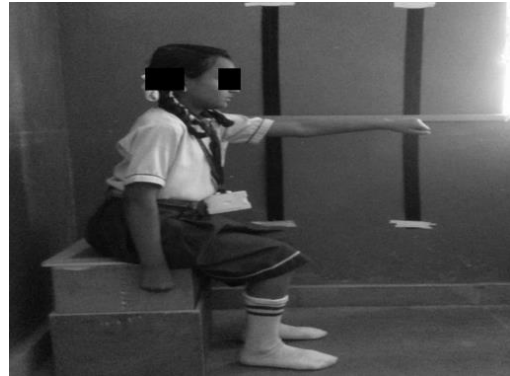
Fig. 2: End position for modified forward reach test