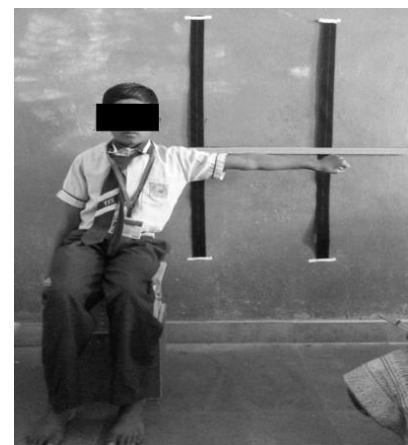
Fig. 4: End position modified lateral reach test