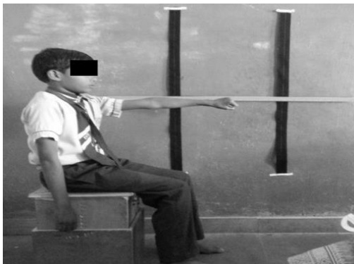
Fig. 1: Starting position for modified forward reach test

A stool with adjustable height was arranged near the wall, where child seated independently with back straight and feet pelvis width apart, touching the floor completely. A yard stick was arranged at the height of the shoulder of the child. Forward reach and lateral reach of the children were measured by asking the child to bend with his/her arm flexed at 90 degrees for forward reach and 90 degrees abduction for lateral reach 6 (Fig. 1-4). Three successive measurements were taken in centimetres. Mean of the three finding was calculated for each child. No unexpected responses or injuries occurred during testing.