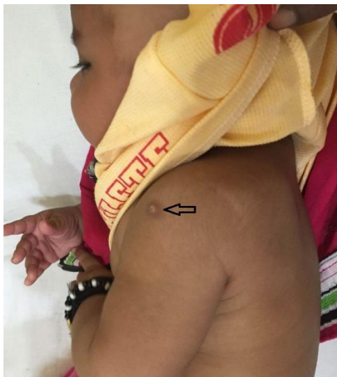
Fig. 1: Clinical photograph of 02 months old male child presenting with swelling and erythema at BCG vaccination site at left arm (Arrow). This patient presented with axillary swelling of 1.5x 1cm, which on FNAC yielded grayish particulate aspirate