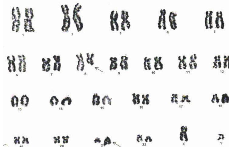
Fig. 2: Karyogram 46XX, t(9;21)