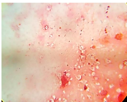
Fig. 2: Picture shows gram negative bacilli in singles and groups