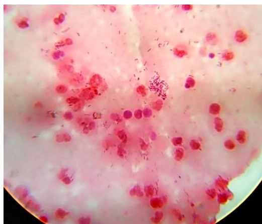
Fig. 1: Picture shows pus cells with gram positive cocci in singles, pairs and chains