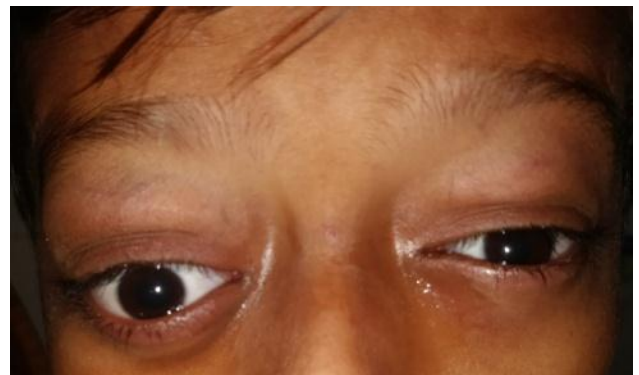
Fig. 1: Bilateral proptosis and mass below brow in right eye causing inferior dystopia of right eye.

lymphadenopathy. On ocular examination there was bilateral proptosis and visual acuity was 6/6 in both eyes. On palpation firm ill defined swelling was felt below brow in right eye which had pushed the right eyeball downwards (Fig. 1). Ocular motility was limited in upgaze in right eye. Fundus examination was normal in both eyes. CT scan revealed an evidence of a uniform, ill defined lesion occupying the orbit. (Fig. 2). Based on these clinical features differential diagnosis of leukemia, lymphoma, metastatic neuroblastoma and orbital pseudotumor were made.