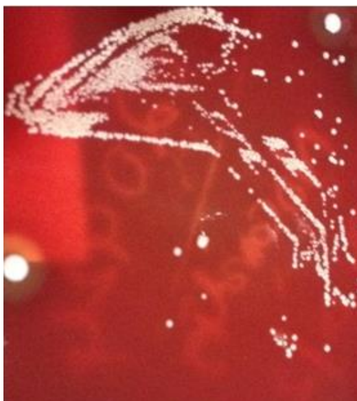
Fig. 2: White, dry and wrinkled colonies of Nocardia on blood agar