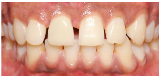
Fig. 17-18: Post-operative view, one year follow up