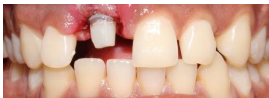
Fig. 11: Prosthetic preparation of the core

Diamond burs and polishing discs were used to reduce high points, followed by interproximal flossing. Static and dynamic occlusions were checked. The patient was recalled after 3 weeks for re-checking for occlusion, proximal contact relationships, marginal integrity, and gingival marginal health.