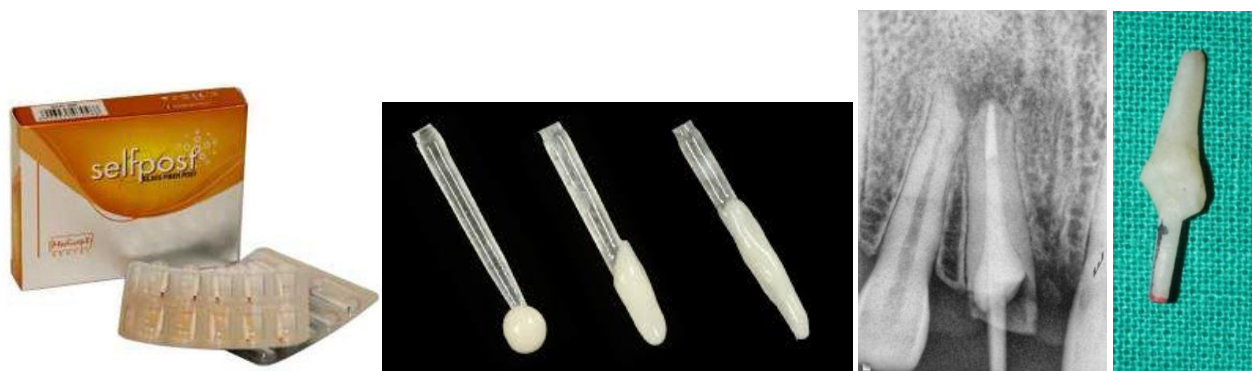
Fig. 8: Radiographic and clinical appearance of anatomic post