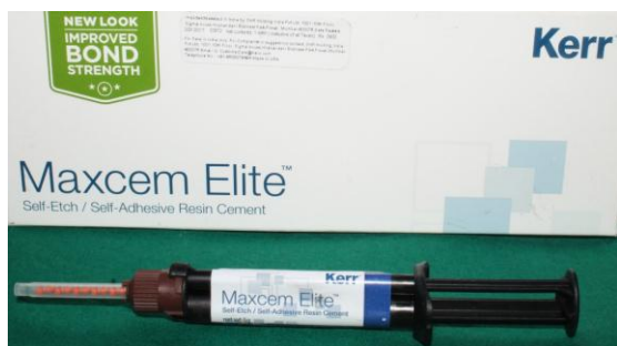
Fig. 14: Maxcem Elite self-etch, self-adhesive resin cement (kerr)