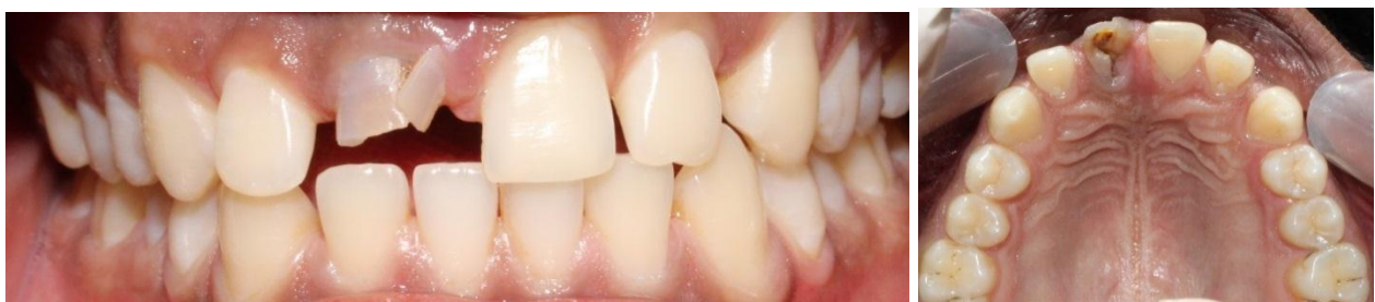
Fig. 1&2: Initial labial aspect, Initial palatal aspect