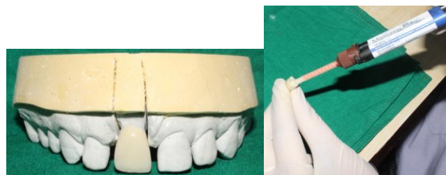
Fig. 15,16: Final master cast with crown prosthesis, Cementation of crown prosthesis