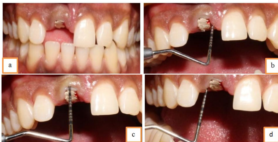
Fig. 9: (a-d showing pre-operative required length for CLP)