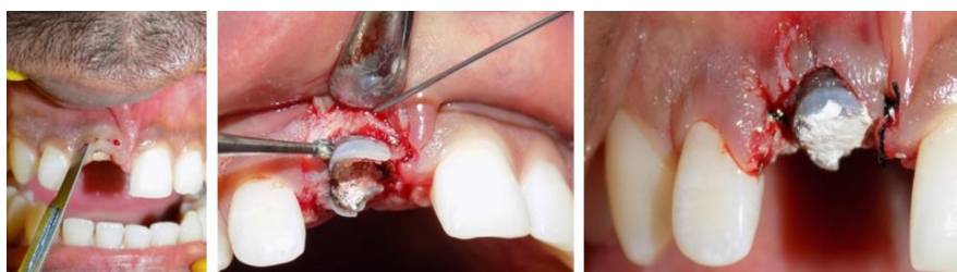
Fig. 10: Clinical crown lengthening procedure

Flap was raised and 3mm osseous reduction was done followed by placement of interdental sutures, and COE pack.