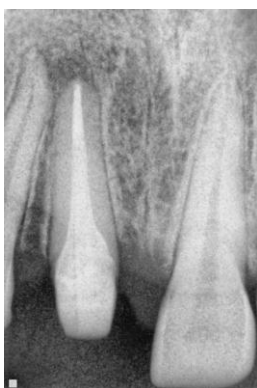
Fig. 12: Final radiographic appearance glass fiber post and core