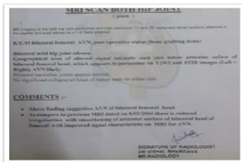
24 week postop. MRI