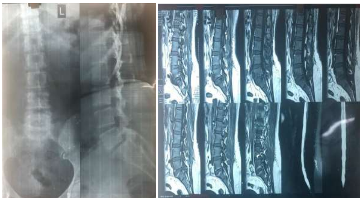
Pre-Operative X –Ray