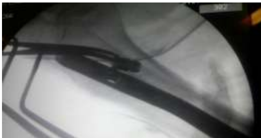
Fig. 2: Use of a curved hemostatic forceps inserted through the nail entry point for the retrieval of End cap from the posterior medullary canal