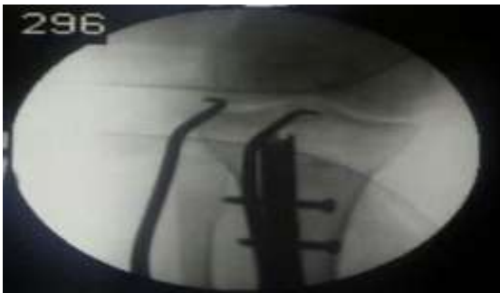
Fig. 1: Anteroposterior view showing the end cap having missed the nail head

A “fish hook technique” using a bent k-wire, may also be used for misplaced end cap extraction. 10