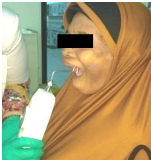
Fig. 5: Retention measurement

Data normality test was carried out using the Kolmogorov-Smirnov test and obtained a value of p \Rightarrow 0.05 , which means that the research data was normally distributed. From the results of the study it was found that in the anterior the largest value was found in group C which was 5.53 mm and the smallest value was in group D which was 2.61 mm. In the posterior area the largest value was found in group C which was 5.67 mm and the smallest value was in group B which was 3.21 mm. (Table 1). The highest retention measurements were found in the sample groups C and D that is equal to 54 N while the smallest value is obtained in the sample in groups A, D and B which is equal to 33 N. (Table 2)