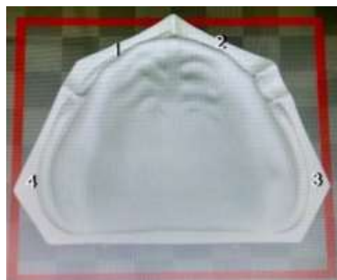
Fig. 6: Morphological detail measurement with CAD / CAM image