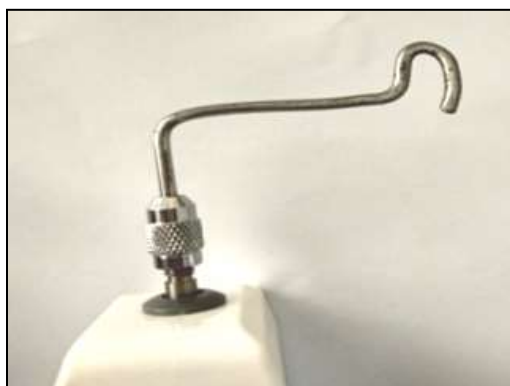
Fig. 4: Hook modification of push and pull gauge