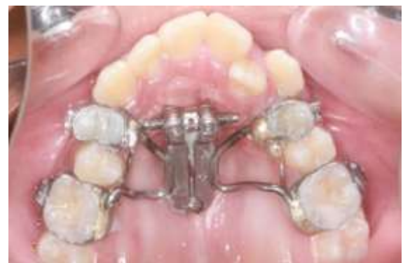
Fig. 1: RME appliance

In the present study, 5 patients treated with RME followed by fixed appliance therapy were selected.