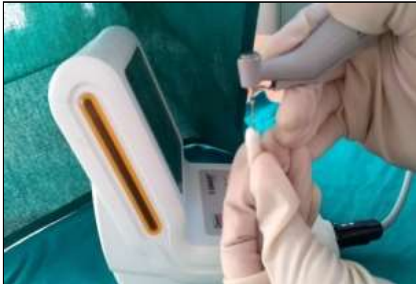
Fig. 1: Cleaning and shaping using endomotor and protaper

(Fig. 1). In between each file irrigation was done with sodium hypochlorite (NaOCl) + normal saline.