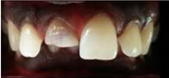
Fig. 1: Pre-operative image

After cementation, the crown preparation was completed, an impression was recorded using addition silicone impression material (Aquasil, Dentsply USA) and an All Ceramic crown. (IPS E-Max System, Ivoclar Vivadent) was fabricated. [Fig. 6]