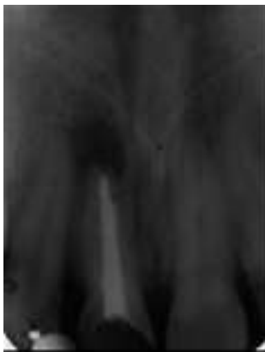
Fig. 2: Obturated radiograph