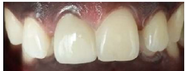
Fig. 6: Crown cemented