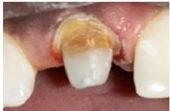
Fig. 5: Cemented post and core