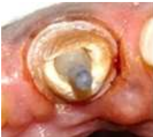
Fig. 3: Fit of anatomical post in the canal with crown preparation