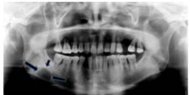
Fig. 1: A well-defined radiolucency at the level of right second molar region below the inferior alveolar canal suggestive of stafne cavity

[Fig. 2]. Computed tomography (CT) axial view shows a hypodense area in the mandibular molar region on right side suggestive of defect [Fig. 3]. Considering the radiographic features a retrograde clinical examination was done, patient was healthy and did not report any relevant information regarding medical or dental history, and did not mention the use of any medication previously. Patient did not give any history of swelling, pain or sensory disturbance. On further clinical examination, did not reveal any pathology and vitality test was done in relation to the right first and second molar which responded and was interpreted teeth were vital. A final diagnosis of Stafne bone cavity was made based on clinical and radiological findings, and no further therapy was instituted. Patient was recalled every month for a period of 8 months to access any increase in size of the lesion, where in the lesion appeared same size after 8 months.