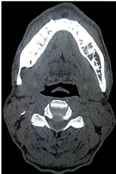
Fig. 3: Axial CT view showing defect