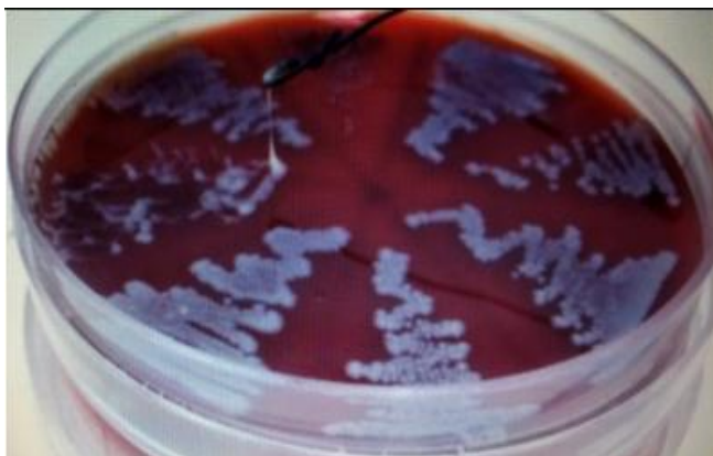
Fig. 2: Positive string test showing hypermucoviscosity among strains of K. pneumoniae