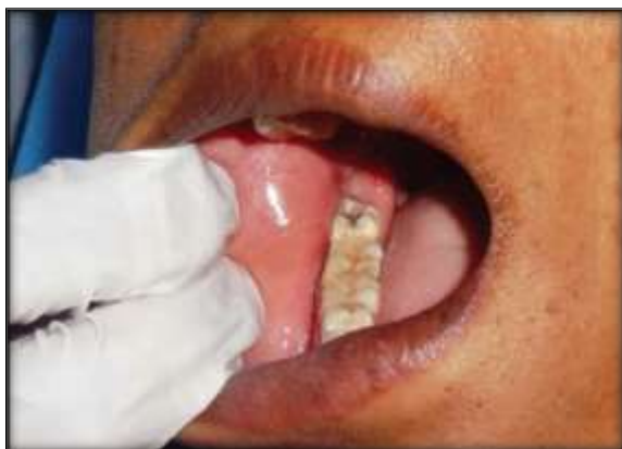
Fig. 3: Hydatid cyst in buccal mucosa

Very rarely these occurs intraorally. First reported in 2000 by Bouckaert et al. by reporting 2 cases of intra oral