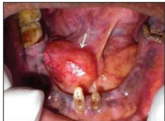
Fig. 4: Hydatid cyst in floor of mouth resembling ranula

Diagnosis of the cyst is based on patient’s history, clinical features, radiological examinations, biochemical examinations and histopathology. Histopathology remains the gold standard for diagnosis.