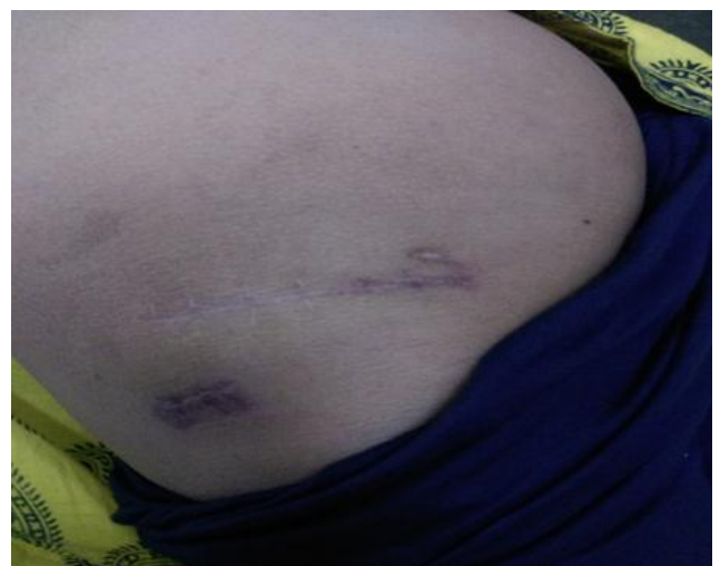
Fig. 1: Post operative healed wound

An oblique incision was made and we found that a large cyst was present there and to our surprise the part of cyst was going deep into the muscles and was much bigger than expected. Cyst was of about 10 × 8 cm in size, thick walled, adherent to the gluteal muscles and contained yellowish thick fluid. Cyst was removed in total. Skin was closed primarily, along with negative pressure suction drain. Stitches were removed on the 14 th day. Drain was kept till drain output became less than 15ml. The wound healed well (Fig. 1) Fluid sent for cytology on ZN staining showed occasional AFB. Histopathology showed fibrocollagenous tissue with multiple granulomas with areas of caseous necrosis. AFB not seen (Fig. 2). Patient started with antitubercular drugs. Anti-tuberculosis chemotherapy was started with rifampicin, INH, pyrazinamide and Ethambutol. The last two drugs were withdrawn after two months and first 2 drugs were continued for 4 months. At the 6-month follow-up, the patient was asymptomatic without any recurrence.