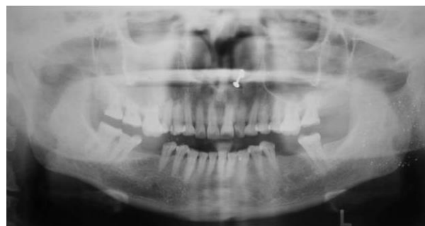
Fig. 4: Panoramic Radiograph showed diffuse hazy uniform radiopacity in the right maxillary sinus and the floor of the sinus was unable to appreciate compared to the left side