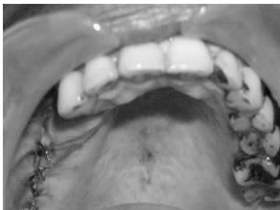
Fig. 6: Post-operative photograph