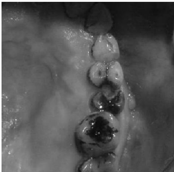
Fig. 1: A well-defined solitary, oval swelling noticed in the right maxillary posterior region intraorally

hyperchromatic nucleus in most areas with thickening and proliferation of the epithelium in areas of inflammation. The connective tissue wall shows fibrous tissue with mainly chronic inflammatory cell infiltration, extravasated RBCs and hemosiderin pigment suggestive of radicular cyst. Hence the final diagnosis of radicular cyst involving right maxillary sinus was considered. The patient was showed significant healing on periodic follow up (Fig. 6).