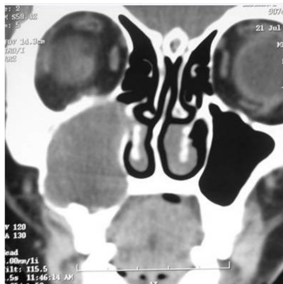
Fig. 5: Computed Tomography scan showed lesion was involving right maxillary sinus with the expansion of sinus and inferiorly invading the hard palate, superiorly eroding the orbital floor and medially nearing the nasal septum