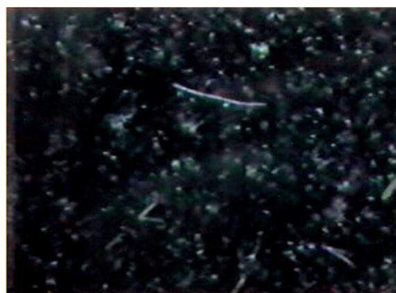
Fig. 5: Dark field microscopy showing spirochetes at baseline