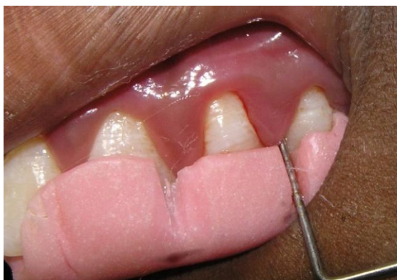
Fig. 1: Pocket measurement with a standardised acrylic stent

experimental local drug delivery system containing tetracycline hydrochloride, serratiopeptidase and bactase can be effectively used as an adjunct to scaling and root planing and is more effective than scaling and root planing alone in the treatment of periodontal pockets. To elucidate the use of this local drug delivery system in future, a long term study carried out on a large sample of subjects is required. Also, in addition to darkfield analysis, culture methods for microbiological analysis of individual periodonto pathogens should be carried out. An attempt is required to find out the efficacy of the experimental material in comparison to the marketed local drug delivery system.