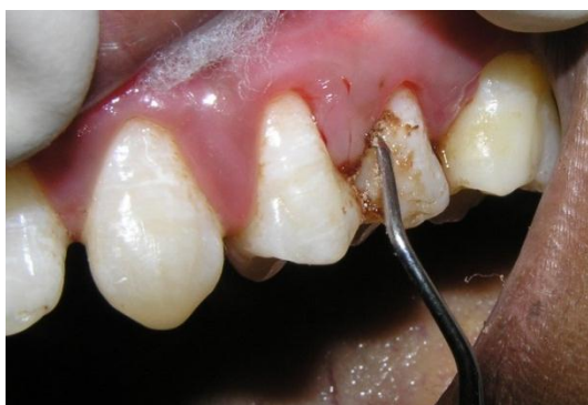
Fig. 3: Insertion and stabilisation of drug inside pocket