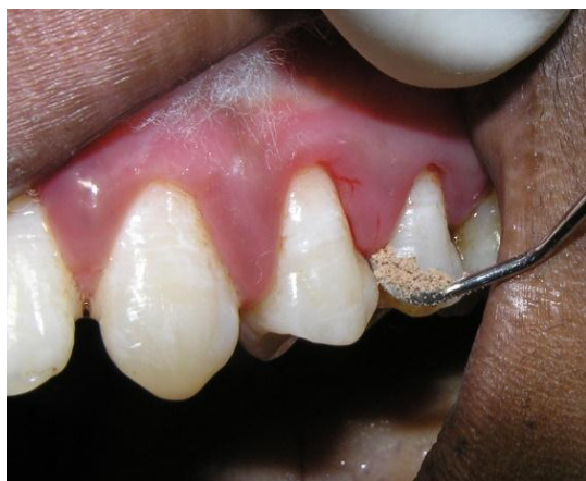
Fig. 2: Drug carried to pocket on a curette