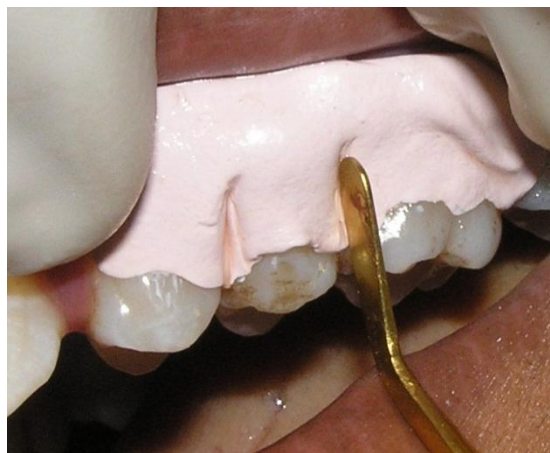
Fig. 4: Application of Coe-pack