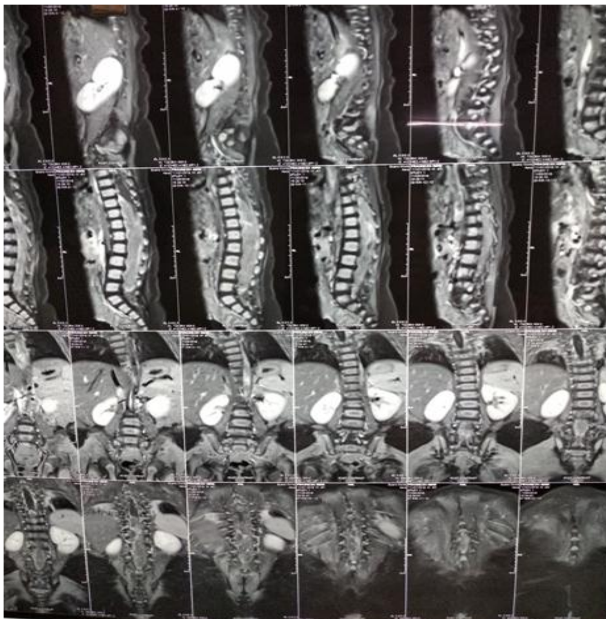
Fig. 1: MRI spine showed a partly well-defined T1 isointense and T2 hyperintense intramedullary lesion extending from upper body of D9 to upper border of L4 showing homogenous enhancement on post contrast study. There was expansion of the spinal cord with scalloping of the vertebral bodies.

hospitalization. Intra operative neuro-monitoring showed only 40-50% Compound muscle action potentials (CMAPs) in both the nerve to quadriceps (L2, 3, 4) and the nerve to sphincter were anatomically preserved. There was tumour infiltration into the adjacent nerves and the conus seen. The post-operative period was uneventful, intravenous antibiotics were continued for 5 days. He was catheterized and discharged on oral antibiotics on day 22 of hospitalization