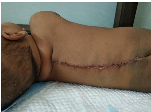
Fig. 3: Post-surgical scar of the patient underwent D7-S1 laminotomy with excision of tumor